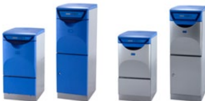
Getinge FD1600 polymeric, under counter and free standing