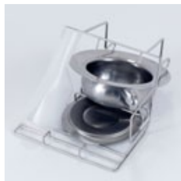
Urine bottle and bedpan with lid

Getinge considers every aspect of the sluice room and provides a wide range of support from training in good hygiene routines to advice on room layout and equipment selection. Getinge also offers a complete furniture concept for the sluice room, enabling to create a hygienic and safe working environment for the customer.