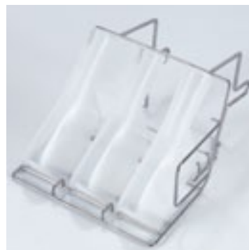
Three urine bottles