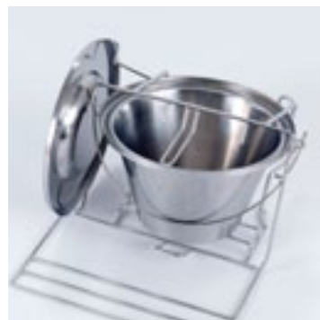
Commode with lid