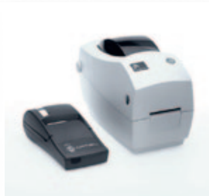
Ticket printer and barcode label printer.