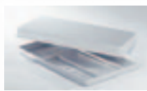
Dental cassette, complete with lid and insert, 287×186×39 mm.