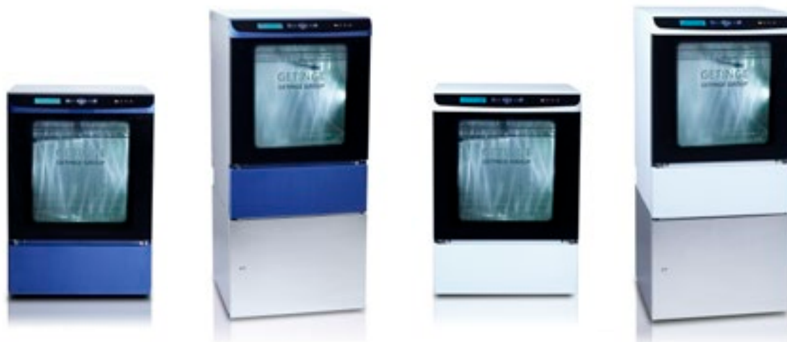
Getinge WD15 Claro

The Getinge WD15 Claro is available in blue/stainless steel or in white powder coated. Both variants can be delivered with a cabinet for a more ergonomic work height.